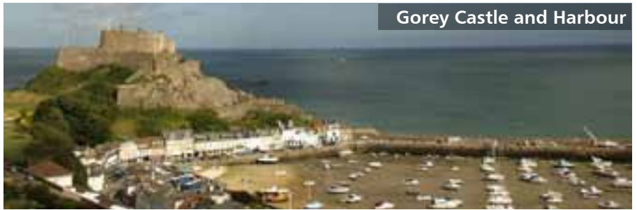
Gorey Castle and Harbour